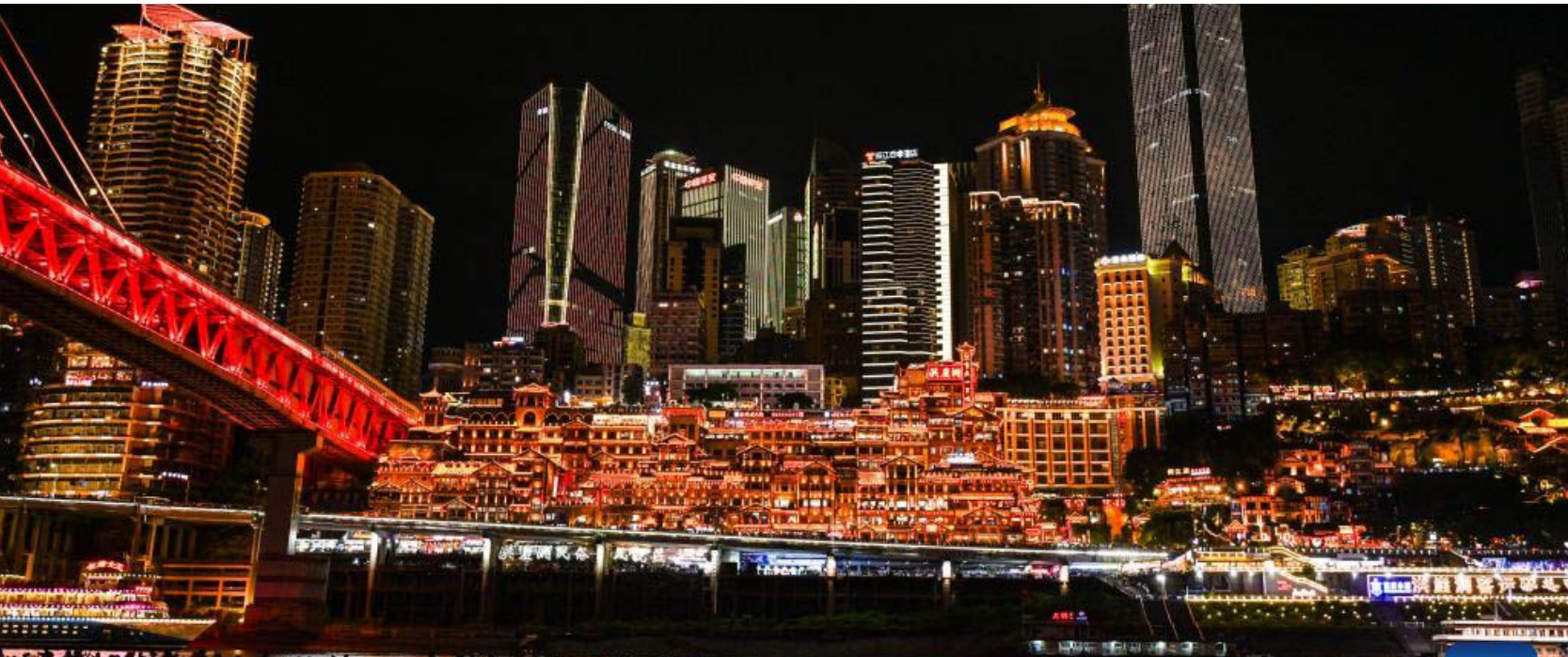
Tourists enjoy the night view of the Hongyadong scenic area by the Jialing River in southwest China’s Chongqing.