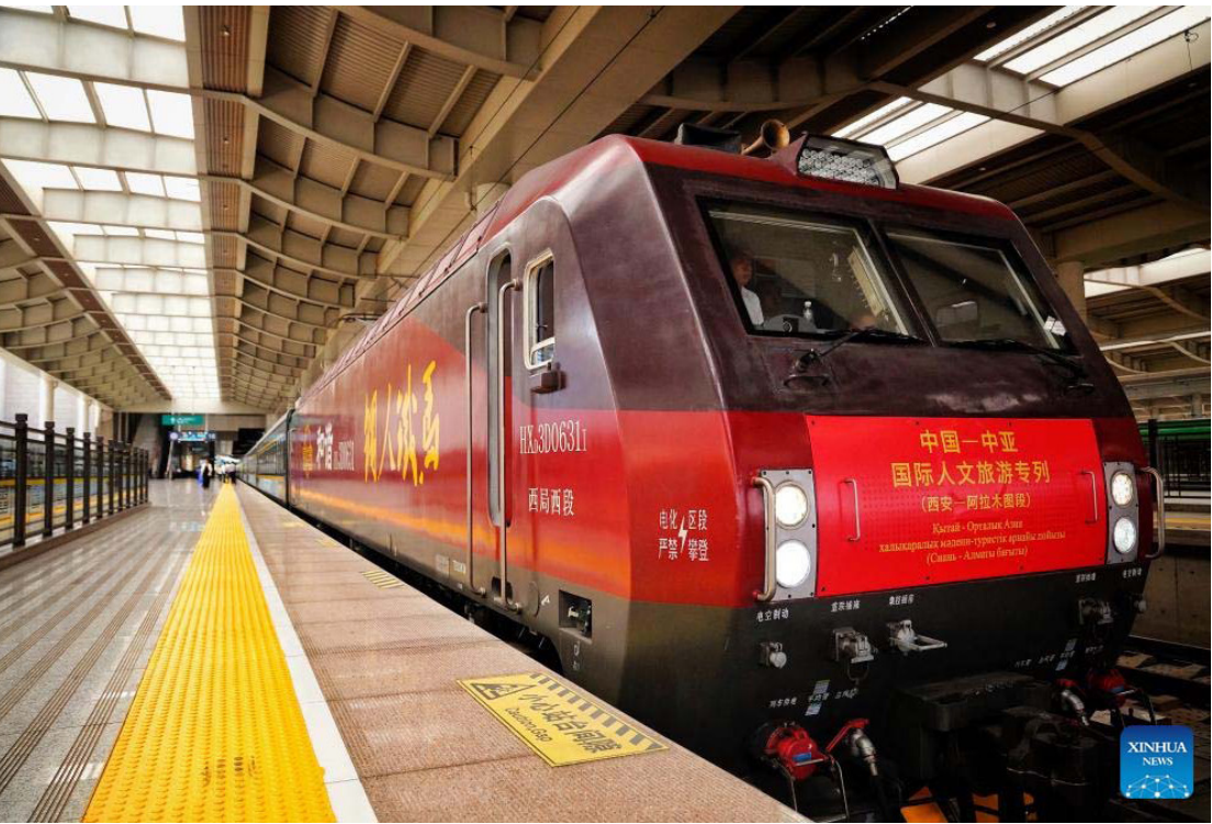
A tourist train departs from Xi’an, northwest China’s Shaanxi Province for Almaty, Kazakhstan.