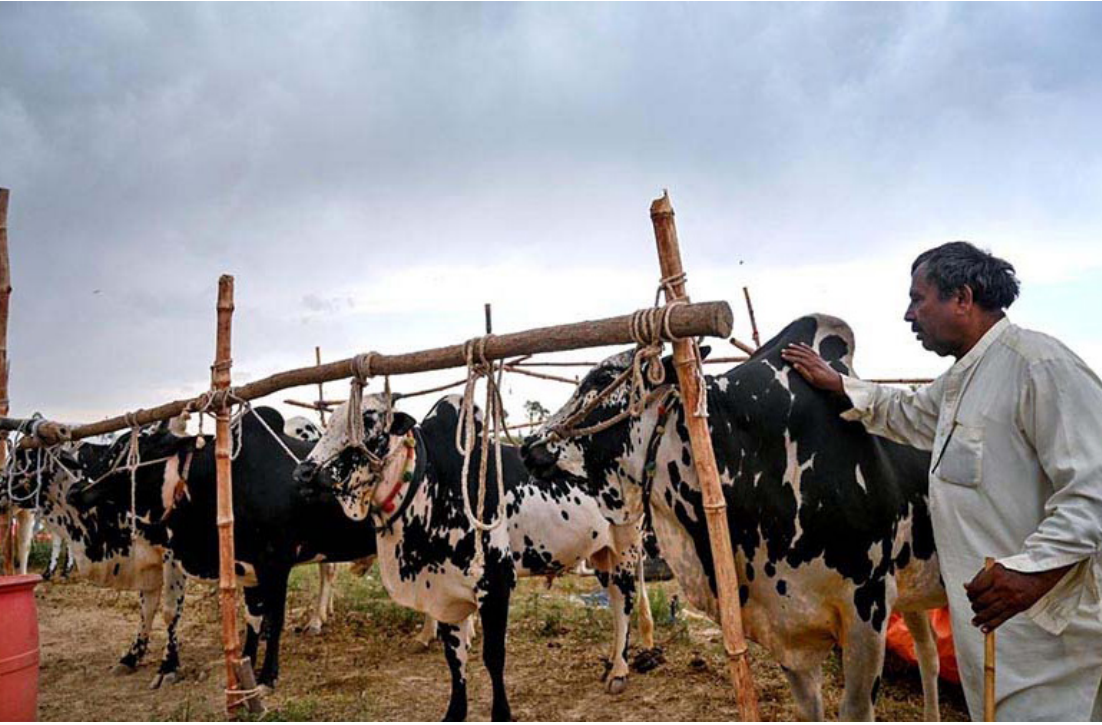
A vendor feeds a sacrificial animals to ensure their good care and well-being before selling them for upcoming Eid-ul-Adha at the cattle market in I-12 sector.