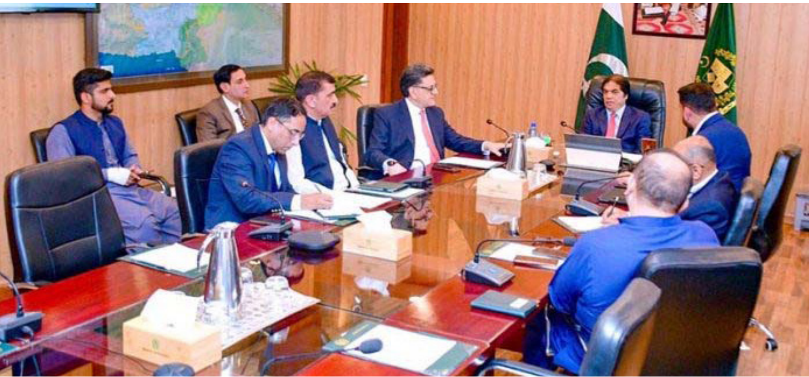
ISLAMABAD: Federal minister for Railways Muhammad Hanif Abbasi chairs Pre-Budget Digitization Meeting at the Ministry of Railways.