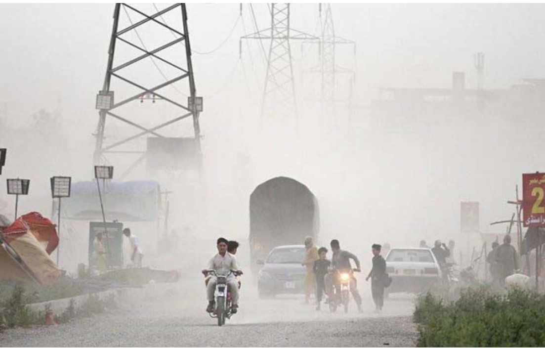
ISLAMABAD: A severe dust storm blankets the federal capital, reducing visibility and disrupting daily life.

APP- ISLAMABAD: National Emergency Operations Center (NEOC) has said that the national polio eradication campaign continued on Thursday with full swing on its fourth day. During the first three days of the campaign, 81% of children across the country have been vaccinated, according to the NEOC. In Punjab, 85% of targeted children have received the vaccine, while in Sindh, the coverage stands at 68%, the NEOC reported. Khyber Pakhtunkhwa has achieved 86% coverage, Balochistan 74%, and Islamabad 63%, according to NEOC statistics. In Azad Jammu and Kashmir, 93% of children have been vaccinated, while in Gilgit-Baltistan, the figure is 91%, the NEOC added. To prevent cross-border transmission of the poliovirus, synchronized campaigns are underway in both Pakistan and Afghanistan, the NEOC said. The NEOC appealed the parents to open their doors to vaccination teams. “The NEOC strongly encourages parents to ensure their children receive polio drops in every campaign.” Vaccinating children under the age of five is a national and moral responsibility for every citizen, the NEOC emphasized.