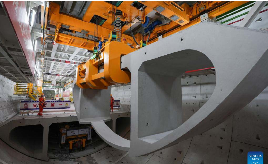
Technicians from China Railway 14th Bureau Group Co., Ltd. operate a crane inside the “Yongzhou” shield tunneling machine in the Jintang undersea tunnel of Ningbo-Zhoushan Railway in east China’s Zhejiang Province.

MONITORING DESK, A South Korean Navy aircraft crashed during a routine training mission on Thursday, killing all four crew members aboard, military officials have confirmed. The P-3 maritime patrol plane, which took off from its base in the southeastern port city of Pohang at 13:43 local time, went down shortly thereafter for reasons that remain unknown, the Navy said in an official statement. Emergency responders, including firefighters and rescue teams, were dispatched to the scene after local residents reported an aircraft crashing into a hillside near a residential apartment complex. The impact sparked a fire, which was later contained by crews at the site. Dramatic images from the scene showed smouldering wreckage amid scorched trees as emergency workers sprayed water over the debris. Authorities confirmed that all four crew members were found dead and that recovery operations were underway.