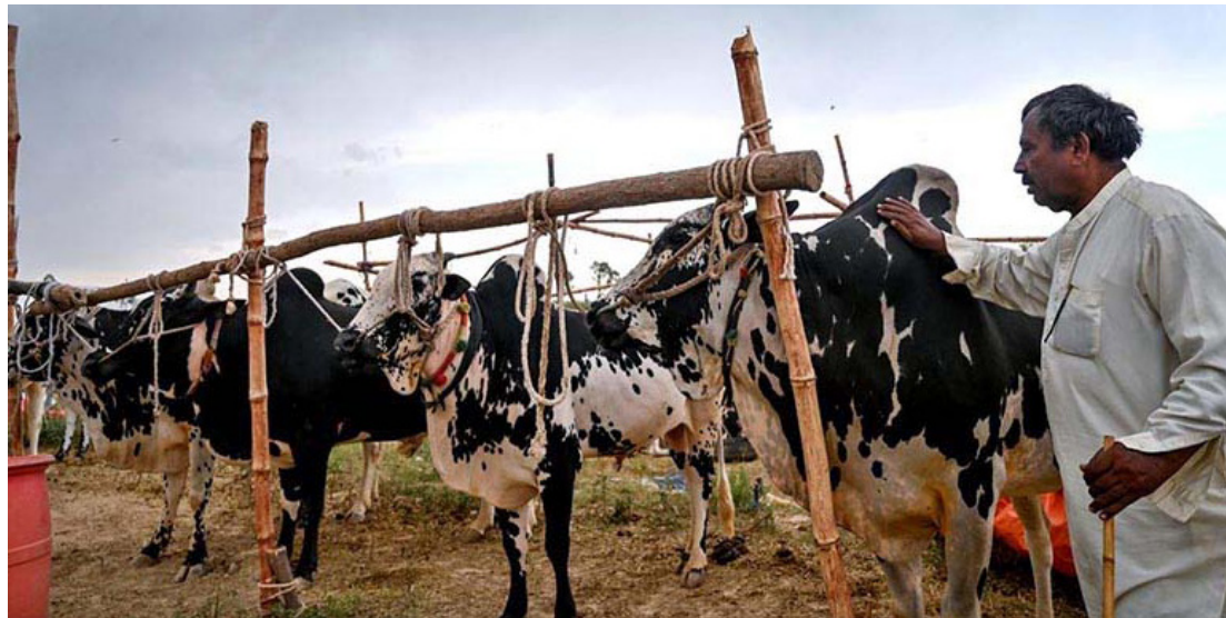
A vendor feeds a sacrificial animals to ensure their good care and well-being before selling them for upcoming Eid-ul-Adha at the cattle market in I-12 sector.

The affected families also warned that if their grievances continue to be ignored, they may be compelled to organize protests to demand justice.